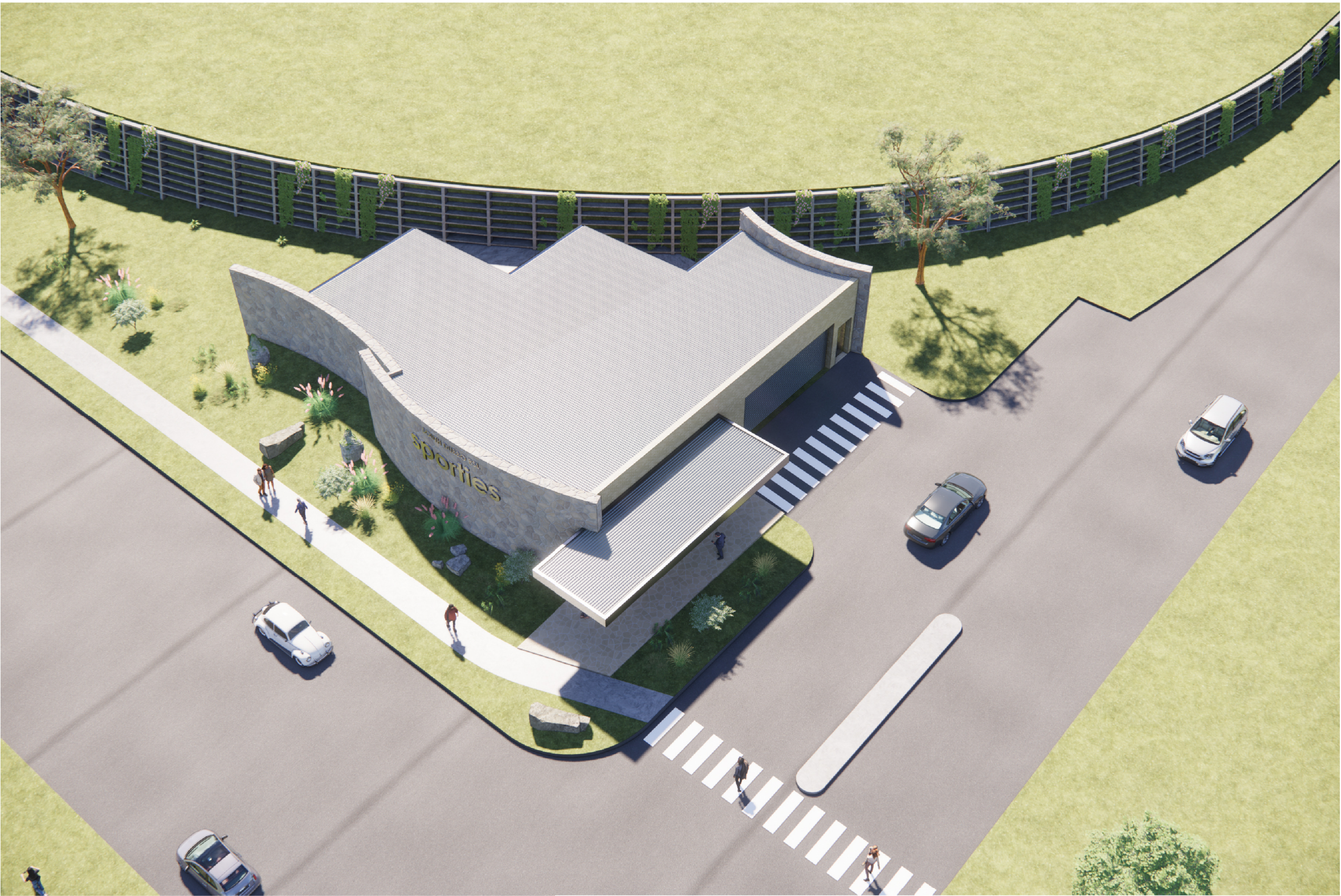
01 AERIAL VIEW LOOKING SOUTH-WEST SCALE N.T.S.