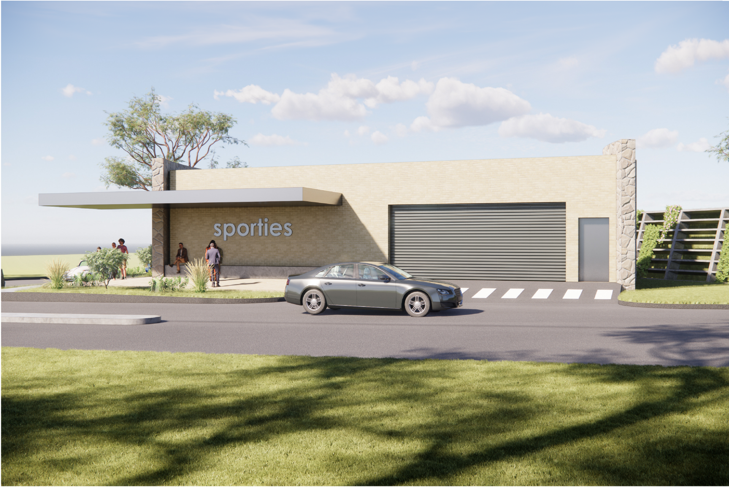
04 VIEW LOOKING SOUTH AT DRIVEWAY SCALE N.T.S.