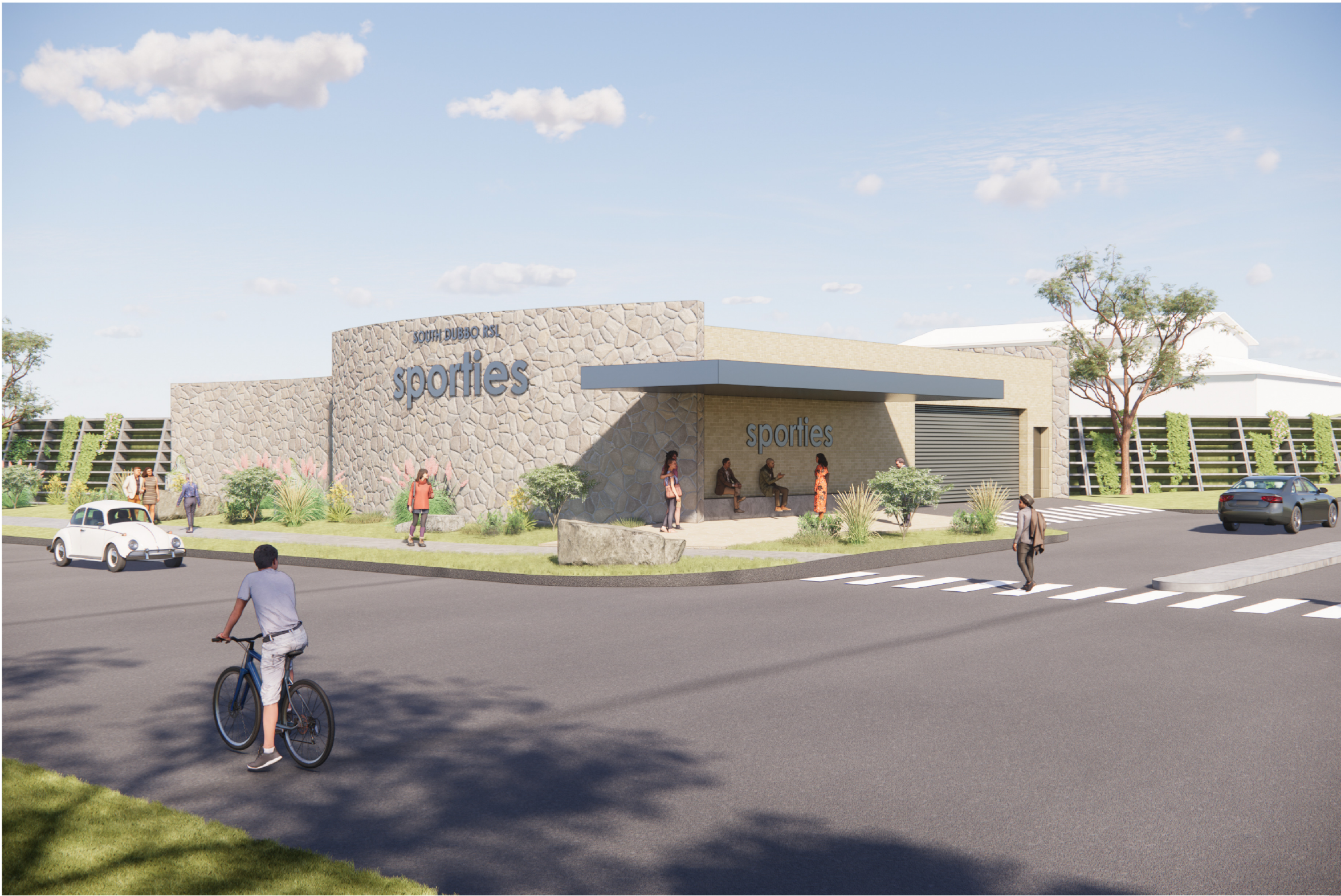
02 VIEW LOOKING SOUTH-WEST FROM HENTY DRIVE SCALE N.T.S.