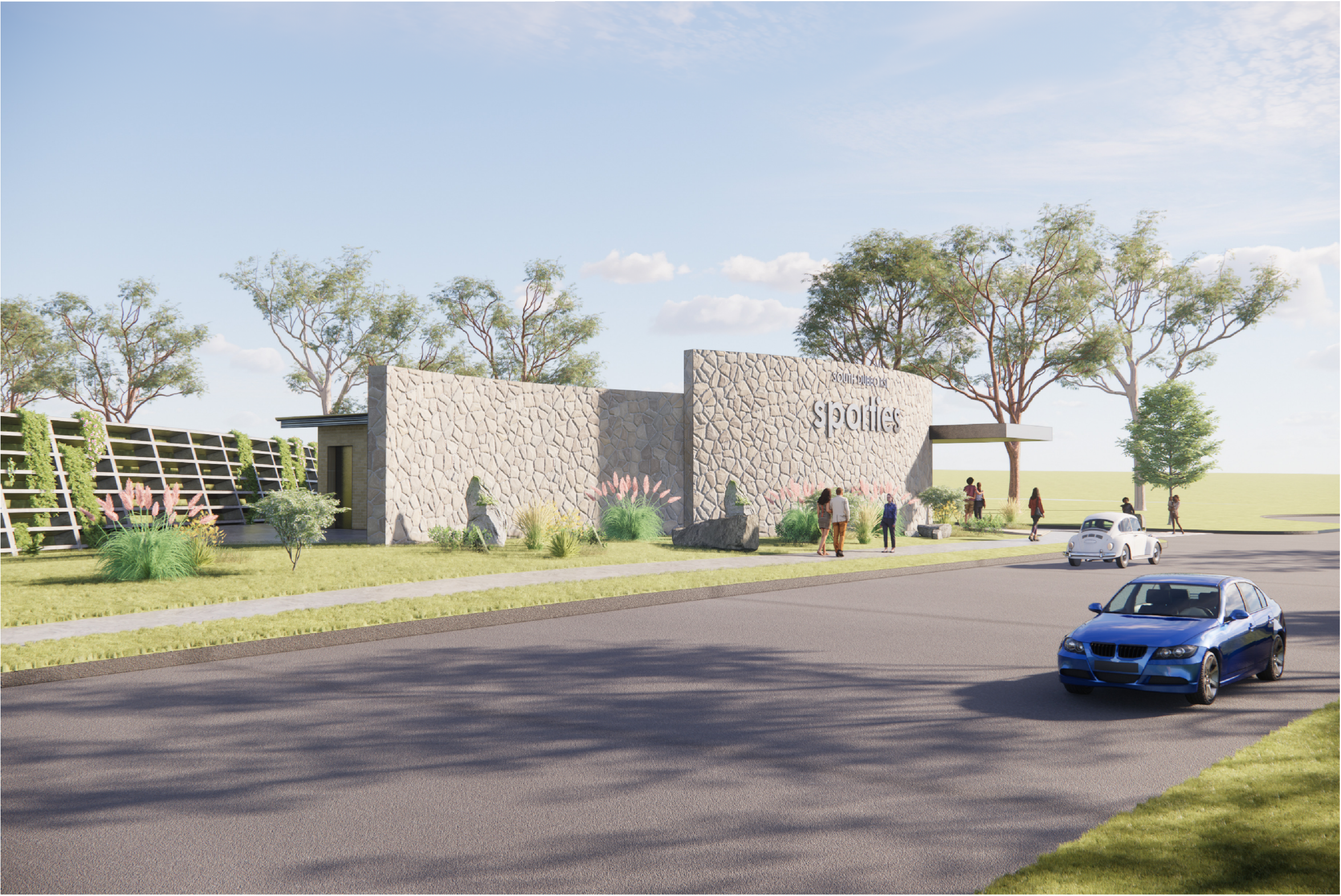
03 VIEW LOOKING NORTH-WEST FROM HENTY DRIVE SCALE N.T.S.